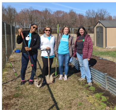
Nemours volunteers open the garden at Carrie Downie, March 2021