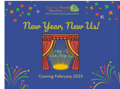
HFHK prepares for unveiling with promo

In early 2021 Healthy Foods for Healthy Kids conducted a branding survey to community members, followers and stakeholders, and through 583 responses we learned two key takeaways: 46.5% of respondents were unfamiliar or not familiar at all with HFHK, but 59.3% replied they would support a nonprofit with our mission. What these numbers indicate is that people want to support our mission, if we communicate our work more visibly.