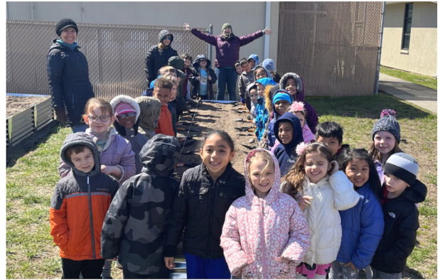
Kindergarteners prepare for their first planting lesson at E Millsboro