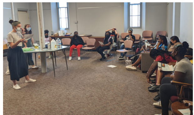
Nemours volunteers talk to Serviam Scholars about nutritional benefits associated with vegetable colors, July 2022