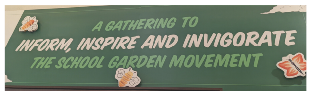
Hundreds gather to inform, inspire and invigorate the school garden movement.

Sessions attended included "Speak their language: Easy peas-y impact communications for diverse stakeholders", "Providing Effective Support to School Gardens in your Region", and "From the Ground Up: Three perspectives on building a districtwide school garden program". The conference kicked-off with tours of Denver Public Schools, where 126 of its nearly 200 schools have a school garden program.