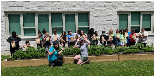
HFHK's Jen and Rachel (front) help students harvest peas and carrots.

Students at Rehoboth Elementary tasted lettuce, spinach, carrots, and peas. Rehoboth rejoined the HFHK program this year after their new building opened in 2020.