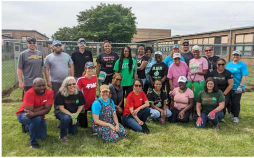
FMC employees, members of Alpha Kappa Alpha and HFHK rebuild the garden at George Read M.S.