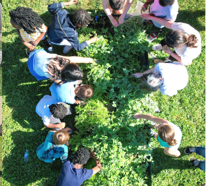
Top (L): Heritage Elementary celebrates their first 5th grade harvest. Bottom (L): 4th graders at John M. Clayton Elementary harvest lettuce.