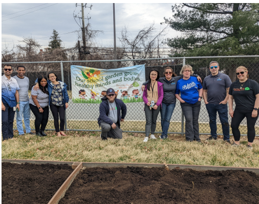
(Bottom) Volunteers from Adesis, Inc. clean the garden at Pleasantville Elementary.