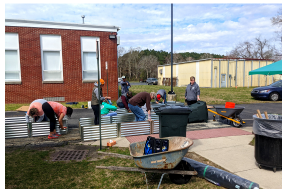
Volunteers and staff from John Clayton build their new garden, April 1, 2022.