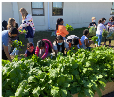
Fifth graders have a bountiful harvest at Phillip Showell in Oct. 2021.