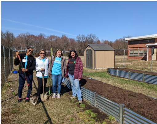
(Top) Volunteers from Nemours ready the garden at Carrie Downie Elementary.

We'll update you in future communications about our 'Adopt a Garden' program and how you can get involved. If your company is interested in participating, please contact Lydia Sarson at lsarson@healthyfoodsforhealthykids.org .