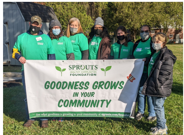
Volunteers from Sprout gather to support the garden build.