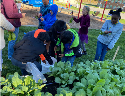
Students at Hanby Elementary wash radishes from their first garden harvest.